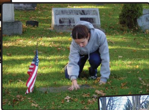
Students visit a local cemetery in November to pray for the dead - and clean up after a wind storm.