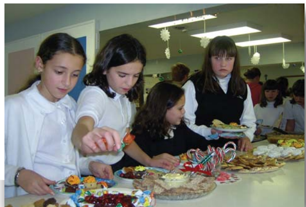
Visiting students from St. Patrick's in Oneida

English students prepared presentations and holiday treats representative of many cultures and traditions throughout the world. Students from St. Patrick's elementary visited Holy Cross and enjoyed participating in the St. Nicholas Day festivities.